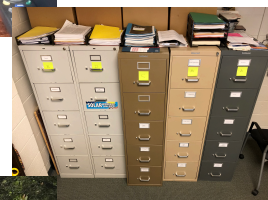
Nagel Hardcopy Files