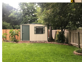
Letts LENR Laboratory