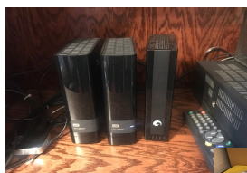
SKINR Electronic Files